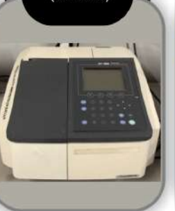
UV/Visible Spectrophotometer (Shimadzu)