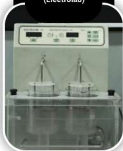
Disintegration Tester (Electrolab)