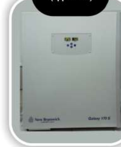
Galaxy Incubator -CO 2 Incubator (Eppendorf)