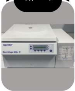
Refrigerated Centrifuge (Eppendorf)