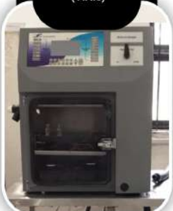
Lyophilizer-Freeze Dryer (Virtis)