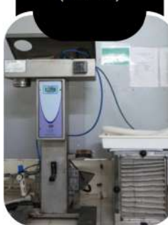
Spray Dryer (Labultima)