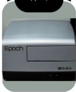
ELISA Plate Reader (Epoch)