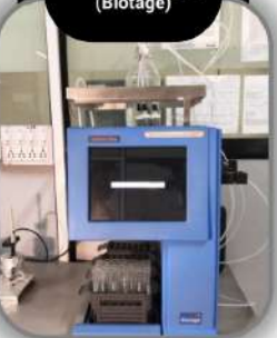
Flash chromatography (Biotage)