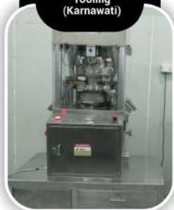
Tablet Punching Machine With Multi Tooling (Karnawati)