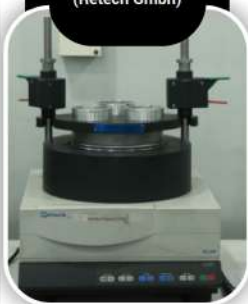
Fluid Bed Dryer (Retech GmbH)