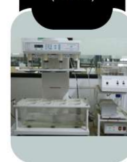
Dissolution Apparatus (Electrolab)