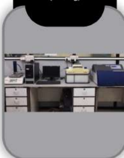
HPTLC System (Camag)