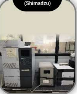
HPLC System with Auto-sampler, PDA & ELSD (Shimadzu)