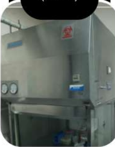
Biosafety Cabinet (Bioklenz)