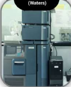
HPLC System with PDA and Fluorescein Detector (Waters)