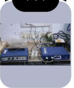
Digital Bio-Signal-Measurement System (Biopac)